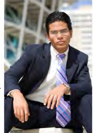
Calling all young professionals!

The IRWA Young Professionals Group is made up of individuals 30 and under currently in the Right of Way profession or individuals who are new to the right of way profession and would like to start their careers off in the right direction.