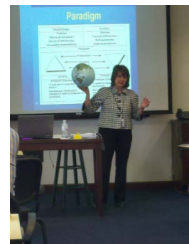
Chapter 41 members learned the finer points of "Negotiating Effectively with a Diverse Clientele" in Ames this spring.